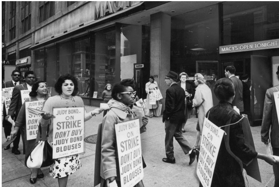
Picketing ILGWU members outside Macy's department store urge shoppers not to buy Judy Bond blouses. Circa 1965.

The exhibition moves on to the period of 1900–1965 with the section “Labor Will Rule,” looking at an era when New York’s unions gained monumental power. By 1950, New York City had about one million union members representing at least a quarter of the entire workforce. However, this power was not equally shared as female, African American, Latino, and Asian American New Yorkers still fought obstacles to their presence in union ranks and leadership.