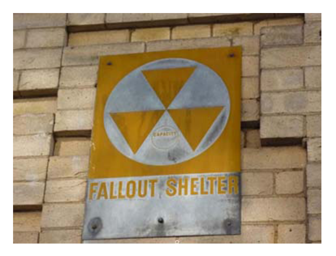
Fallout Shelter Sign, 1961. Photographed 2016.

A DANGER UNLIKE ANY DANGER: Nuclear Disarmament Campaigns 1957-1985